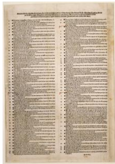
Luther's 95 theses

This upcoming All Saints Eve (October 31) marks the 500 th anniversary of the beginning start of the Protestant Reformation when Martin Luther purportedly nailed his 95 Theses to the door of the Castle Church in Wittenberg. This anniversary gives us a great opportunity to connect with our Reformation heritage and revisit for ourselves these great truths that lay at the heart of the Reformation. In October and early November, we therefore are doing the following: