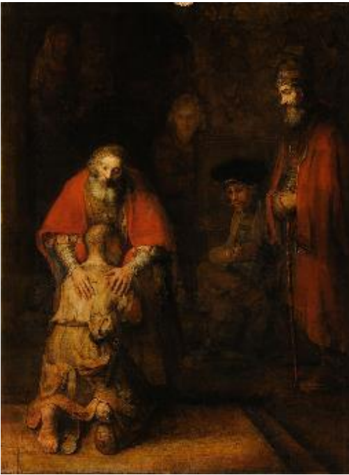
Rembrandt, The Return of the Prodigal Son , 1662–1669 ( Hermitage Museum , St Petersburg )

Jesus should have our undivided attention on this issue. The bottom line is that Jesus is telling us that we cannot appropriate the mercy, compassion and forgiveness of God if we ourselves do not choose to extend mercy, compassion and forgiveness to others;