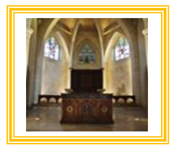
Christ Church, Jerusalem