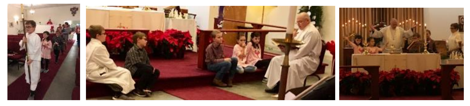
Christmas Lessons, Carols and Midnight Mass